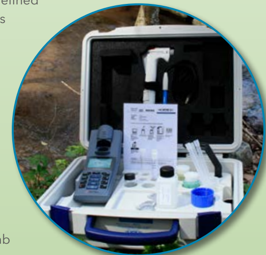
Field Sets: the mobile lab