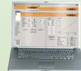
LSdata -Software for • GLP-compliant data management • Programming of user-defined programs