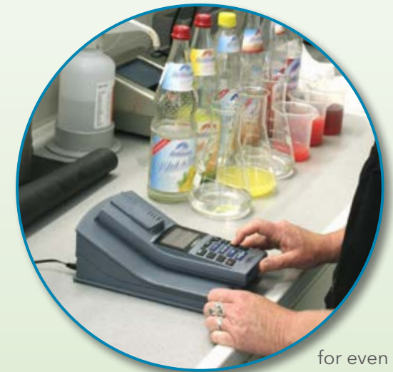
LabStation for even more comfort